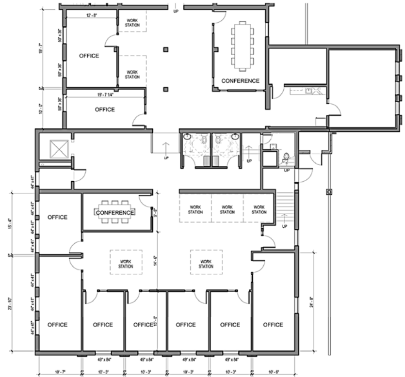
Garden Level Floor Plan